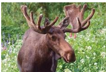
What airplane is the Moose? (see page 5)

Learn more about the VETSmile program, visit VETSmile | VA Center for Care and Payment Innovation .