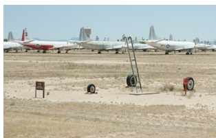
F-117 Stealth Fighter @ "The Boneyard"