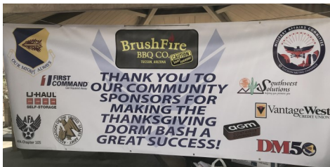
The banner displayed at the 2020 Dorm Feed highlighting the major sponsors for the event