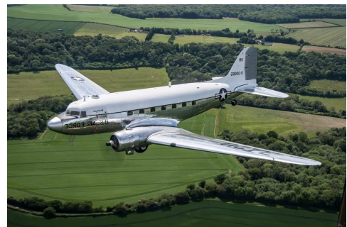
First Flight 12-17-35...88 years ago