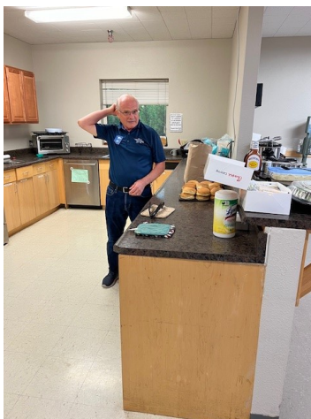
President Saeger trying to figure out the next move