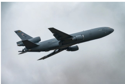
KC-10: End of a career.....heading to the "Boneyard"