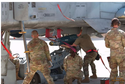
Hawgsmoke 2024 Weapons Load Competition

Hawgsmoke is a biannual A-10 aerial gunnery competition bringing together the best Attack Pilots in the USAF. This year, the event was hosted by Davis Monthan's 47 th Fighter Squadron "Termites" and brought together 13 teams from A-10 squadrons across the US for 5 days of intense flying, heritage, and camaraderie. The event kicked -off on Wednesday, September 11 th with a ceremony at Heritage Park paying tribute to the 9/11 victims and a roll call of all fallen A-10 "Hawg" drivers followed by a flyover and missing man formation of a 4-ship of 47 th FS A-10s.