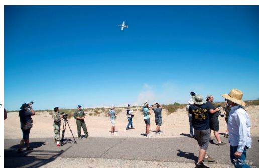
Spectators at Gila Bend Range

The overall winner of this year's competition was the host unit, the 47 th Fighter Squadron. They not only won Top Overall