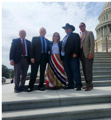
L-R: Wally Saeger, Bryan Foulk, Senator Kyrsten Sinema, 2024 AFA National TOY Ty White, and George Castle pose on the steps of Congress during the 2024 AFA Air, Space & Cyber Conference