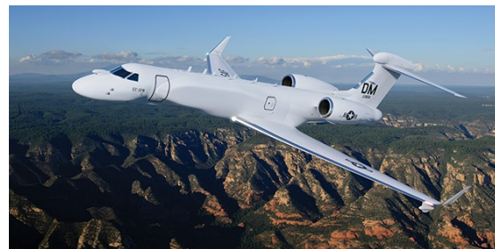
EA-37B "Compass Call": Heading to Davis-Monthan AFB