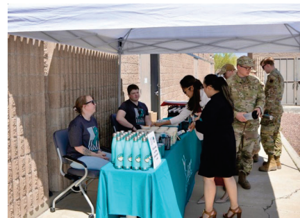
Volunteer Victim Advocates explaining SAPR programs and services to attendees