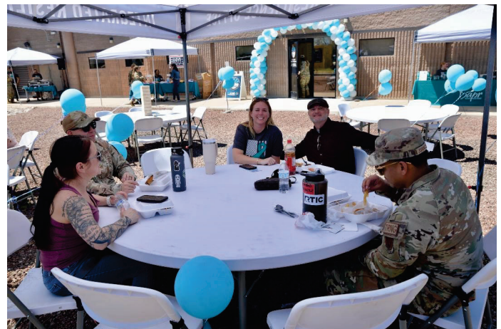
Attendees enjoying the amenities offered at the SAAPM kick-off