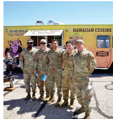
Airmen who toured the Sexual Assault Prevention and Response Office (SAPR) were able to compete for food vouchers for lunches from several food trucks

AFA Chapter 105 co-sponsored the Sexual Assault Awareness and Prevention Month kick-off event on 11 April.